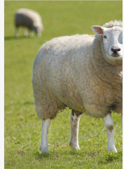
WE HAVE SHEEP