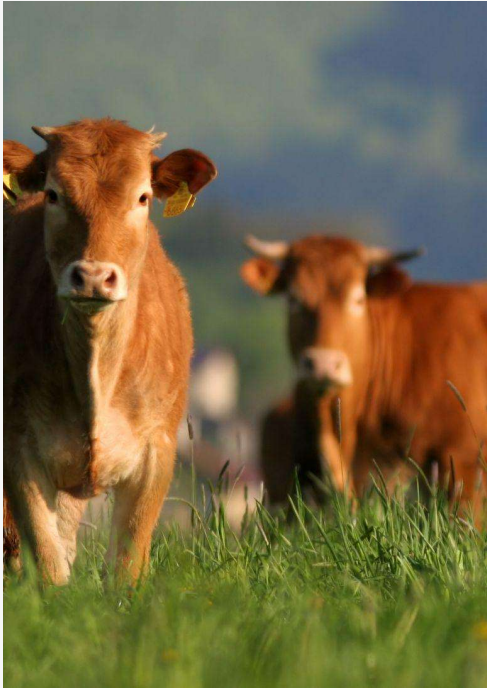
WE HAVE BEEF