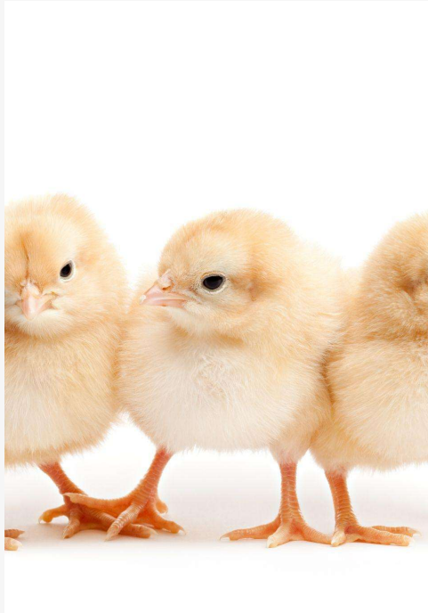
WE HAVE CHICKENS