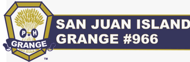
SAN JUAN ISLAND GRANGE